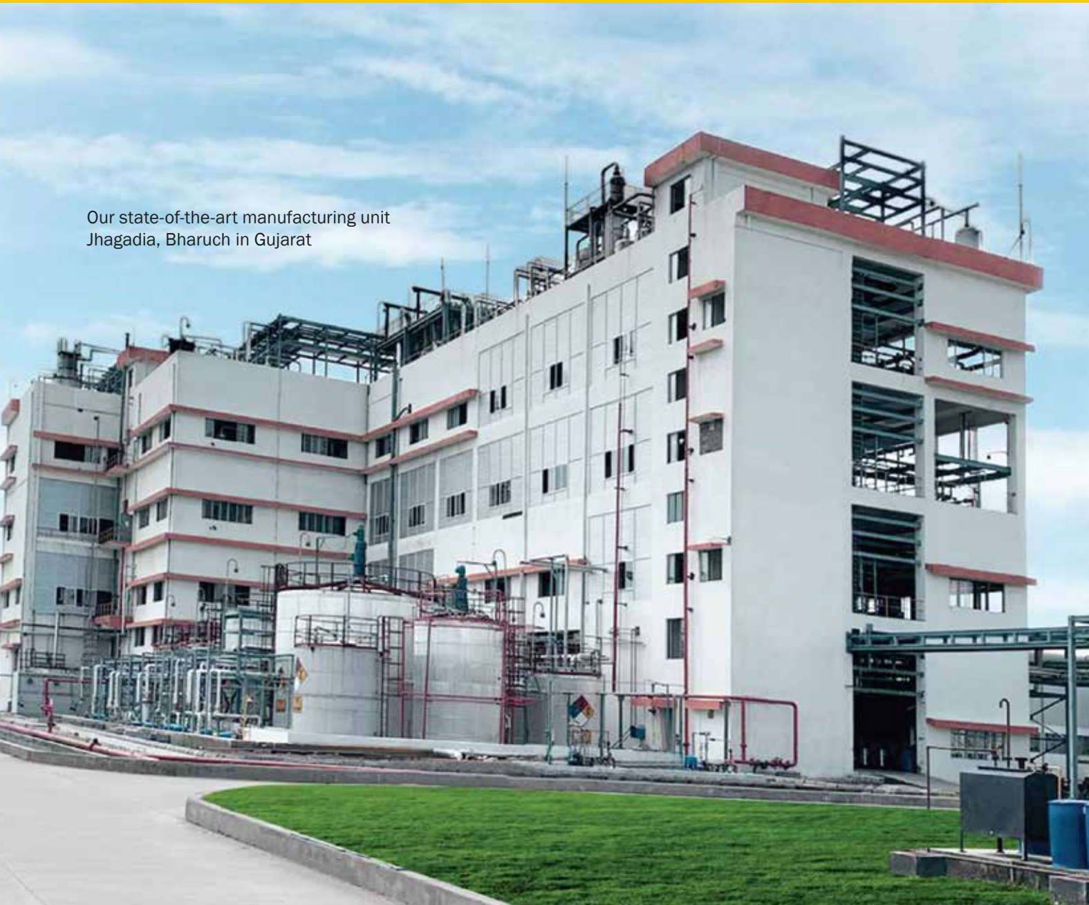
Our state-of-the-art manufacturing unit Jhagadia, Bharuch in Gujarat

To invest in sustainable, innovative technologies and operational excellence to deliver growth in strategically targeted markets together with exceptional customer service.